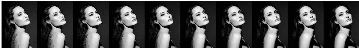
A sequence of images taken through an angle of approximately 30 degrees of Angelina Jolie

Once the beauty retouching had been completed, wrinkles and spots removed, and hair tidied up, the sequence was then further processed by me, which included cropping, contrast adjustment, and colour adjustment to tailor the images for the lenticular process. Most importantly, however, I used my proprietary distortion removal technique and software, which I had originally developed and used to enhance my portrait of the Queen, to remove the three separate distortions present in parallax image sequences. This results in a much more realistic, dimensionally correct, and visually pleasing final three-dimensional image.