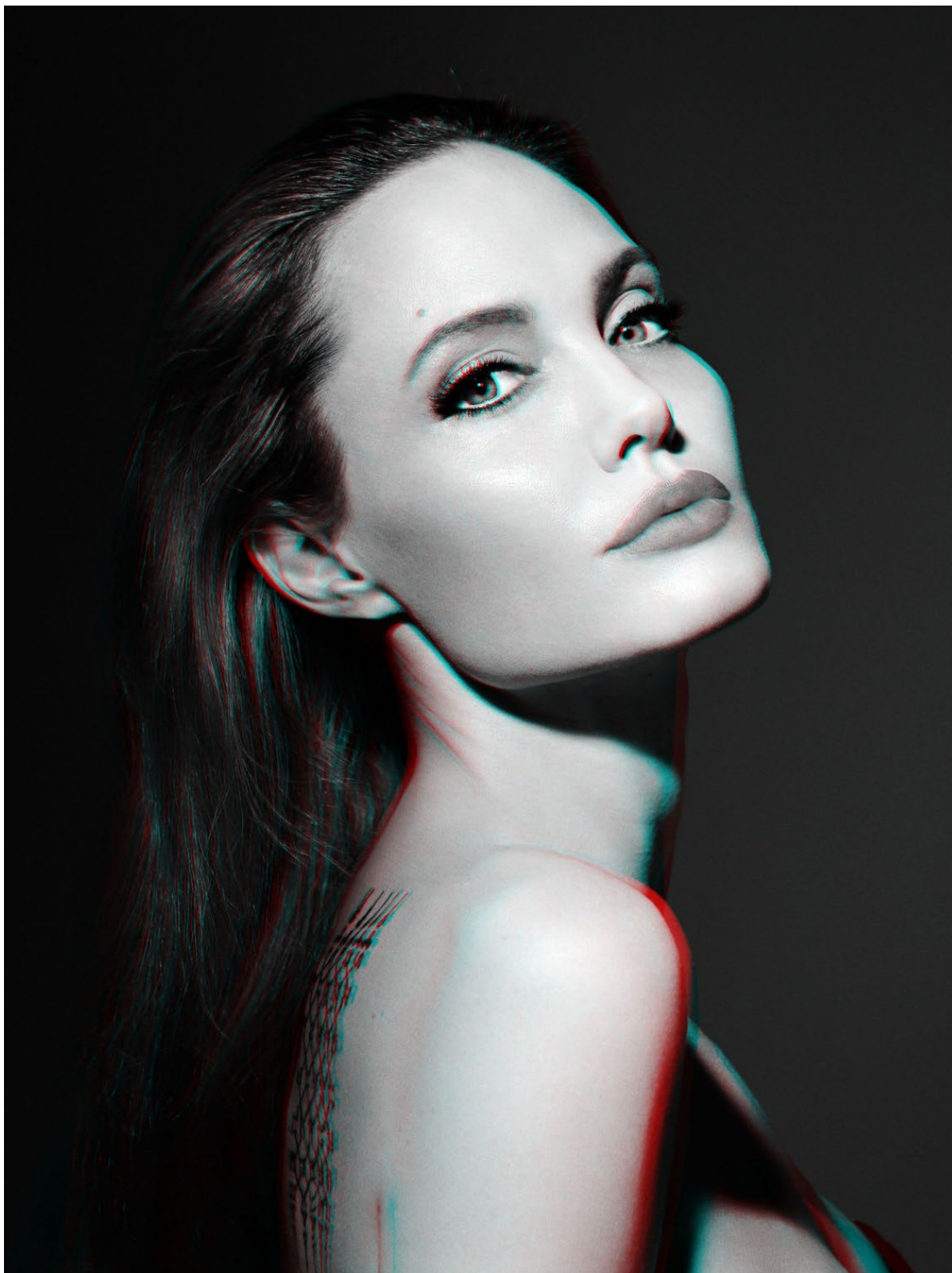
A 3D anaglyph version of Angelina Jolie for Guerlain Fragrance by Rob Munday. Use red/cyan stereoscopic glasses to view the image in 3D.