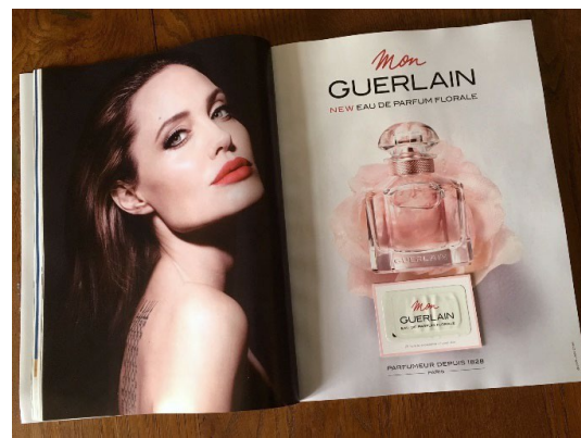
2D displays, point of sale displays, and Vogue Magazine advert.