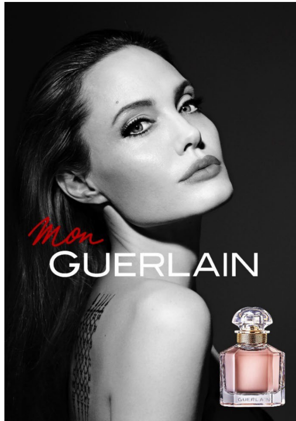
The final three-dimensional lenticular light sculpture

Two years later, it came as a complete surprise to me that Guerlain had chosen my portrait in 2D form, above those shot by Tom Munro, and this time in colour, to launch another new fragrance - Mon Guerlain Floral. The portrait was used for general advertising, point of sale displays, and for magazine adverts, such as in Vogue Magazine.