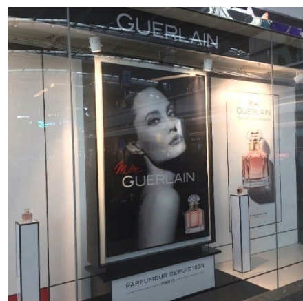
Left: Production at Midwest Lenticular, USA. Right: Promotional display at Heathrow T5, London.